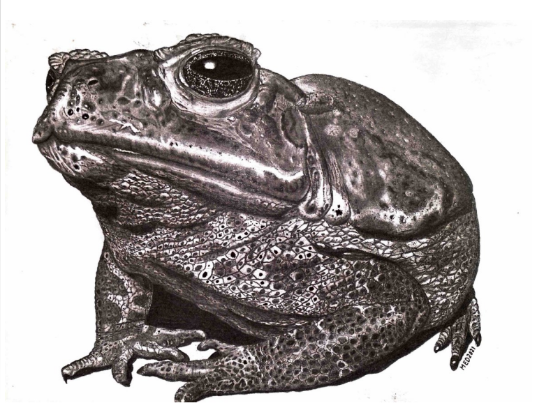
Drawing of a giant cane toad by Michael D.

Classes for the incarcerated. Catalog of information & classes available upon request.