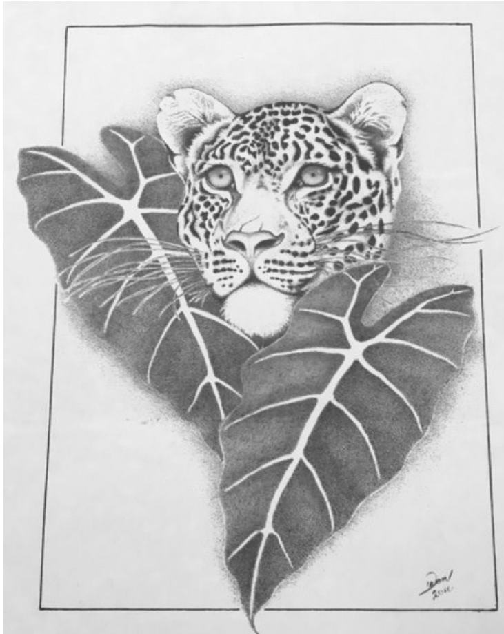
Artist: Bryan D.

Offers spiritual materials on Buddhism. Offers correspondence courses and spiritual materials on Buddhism.