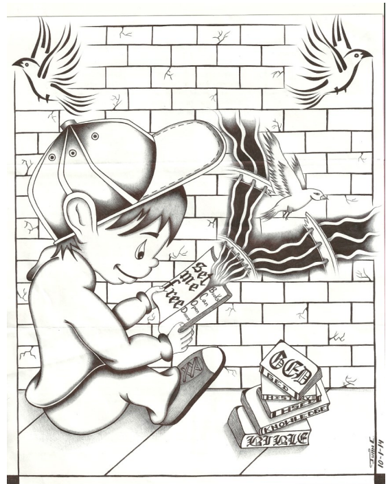
Artist: Juan C

Ideas of Marxist-Humanism and revolutionary social change. Subscriptions for prisoners are free upon request.