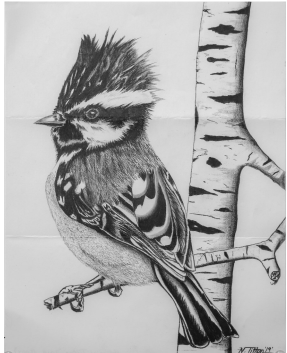
Drawing by Nathaniel T. Maine

Prisoner Visitation and Support (PVS) is the only nationwide, interfaith visitation program with access to all federal and military prisons and prisoners in the United States. PVS DOES NOT VISIT COUNTY OR STATE PRISONS. The visitors make monthly visits to see prisoners who rarely, if ever, receive outside visits. PVS visitors also focus on seeing: those serving long sentences, those frequently transferred from prison to prison, and those in solitary confinement and on death row.