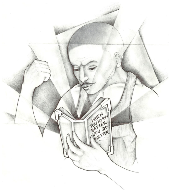
Drawing by Ernesto Cervantes

Information and referrals only. No individual legal aid.